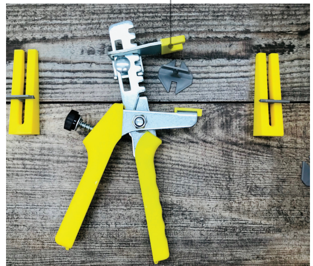
Innovative split wedge design