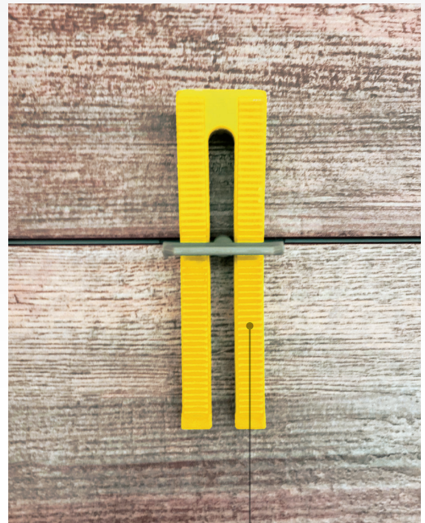
Traction adjustable application tool